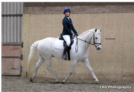
One of our gorgeously turned out competitors!

So you can see how, by just paying attention to detail and making sure your outfit is up to scratch you can make sure you maximise your points.